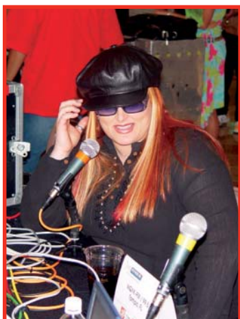
Wynonna chats with her radio friends at the ACM Awards.

Country music artists weren't the only winners at the 38 th annual Academy of Country Music (ACM) Awards, which aired May 21 on CBS. The patients at St. Jude Children's Research Hospital® also racked up when artists who participated in the awards show donated personal items for an online auction to benefit the hospital.